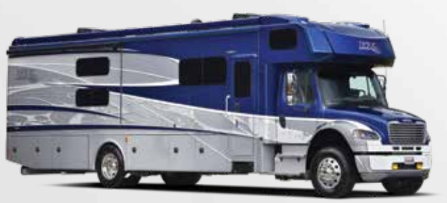
Extended Front Cap with Cab-Over Bunk