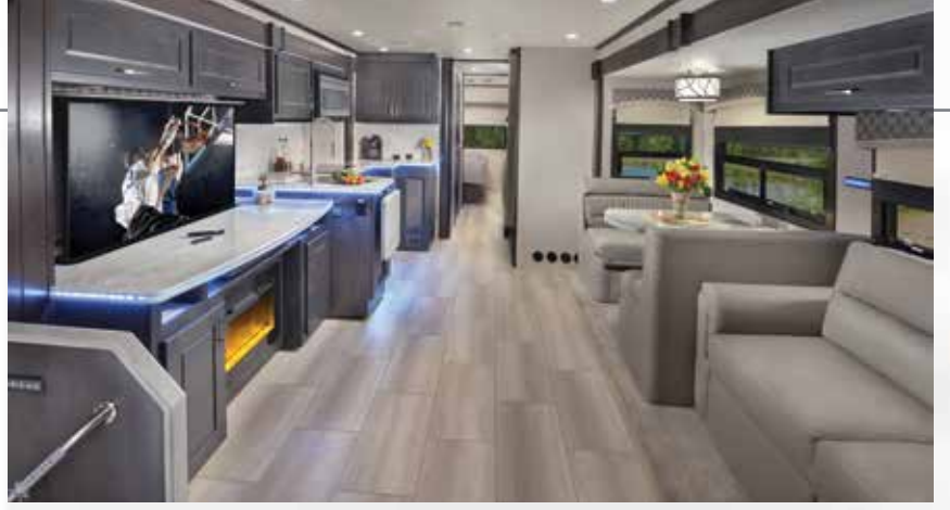
DX3 37TS with Shadow Cabinetry and Carbon décor is shown with the Optional Entertainment Center with 50" LED TV and Fireplace.