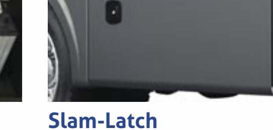
Baggage Doors Our heavy-duty aluminum doors feature metal slam latches.