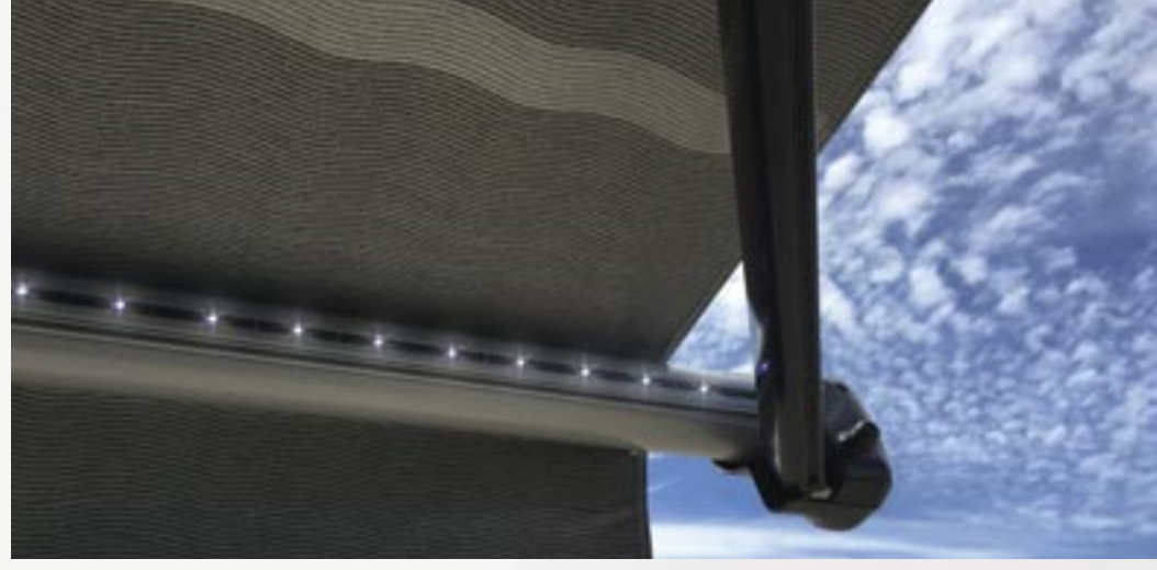
Power Awning with LED Light Strip Dual-Pitch, armless awning retracts automatically in high winds.

back-lit switch panels, and Bluetooth smart phone app control.