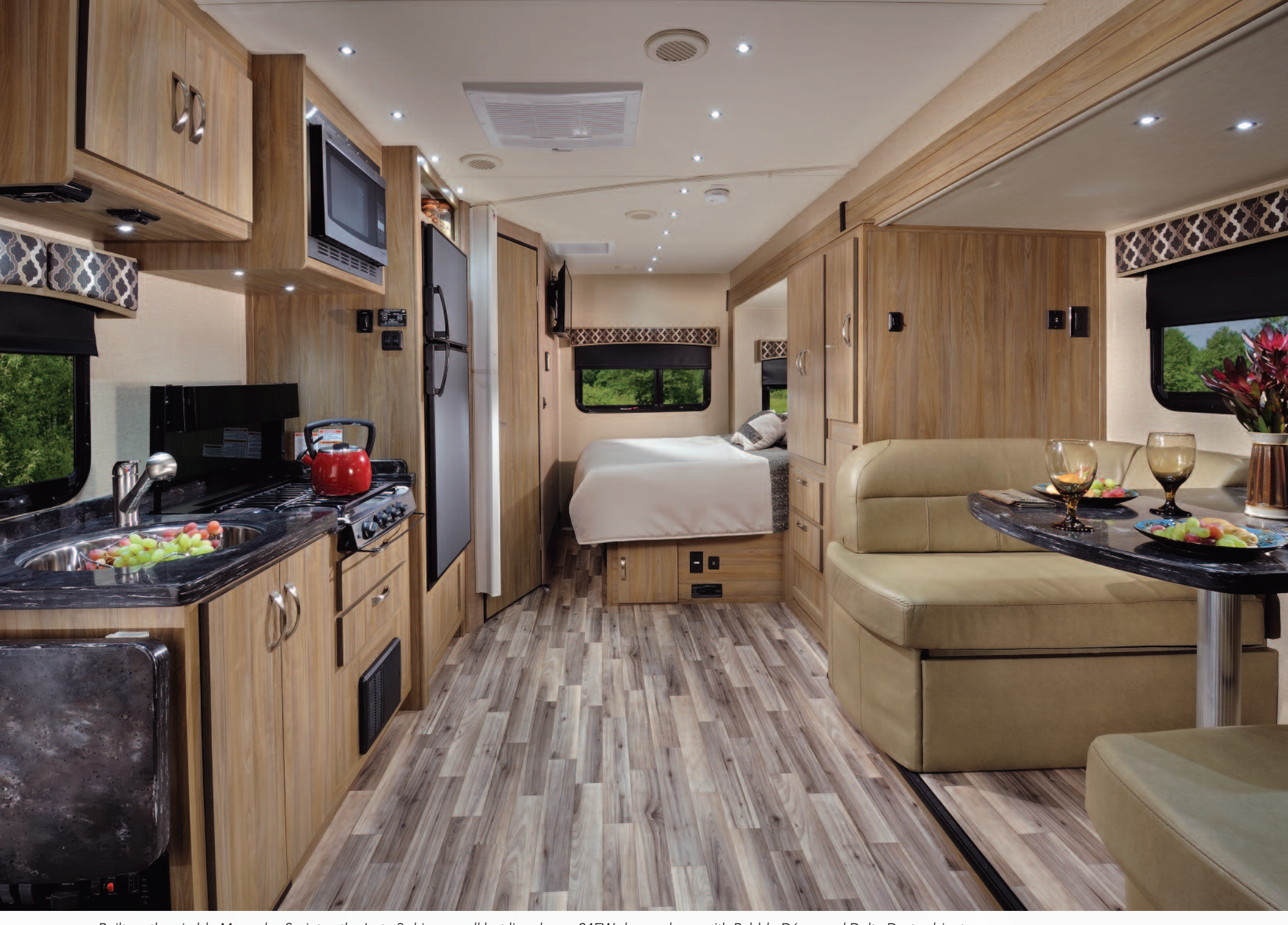
Built on the nimble Mercedes Sprinter, the Isata 3 drives small but lives large. 24FW shown above with Pebble Décor and Delta Dust cabinets.