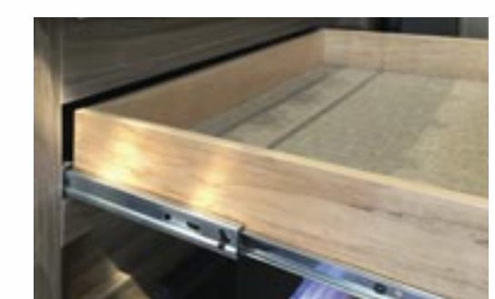
Soft-Close Residential Drawer Guides

The "Soft-Close" feature keeps drawers closed during travel without plastic latches.