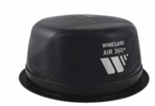
Winegard AIR 360+ with Gateway Router

Each Isata comes with an LP quick connect for use with a portable grill.