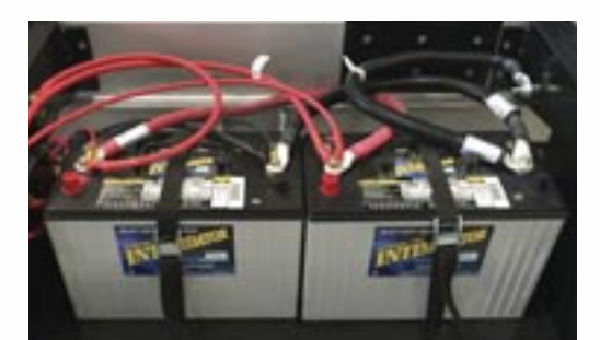
Dual 12V Group 27 AGM Batteries

Developed for military aircraft, they're more durable, longerlasting, and maintenance-free.