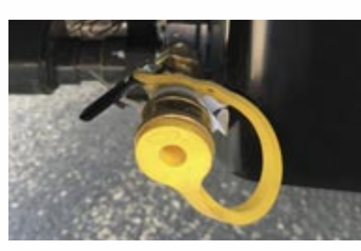
LP Quick Connect

This crowned, one-piece, fiberglass roof is more durable and easier to maintain than TPO or rubber.