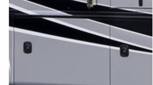
Slam-Latch Baggage Doors Our heavy-duty aluminum doors

Developed for military aircraft, they're more durable, longerlasting, and maintenance-free.