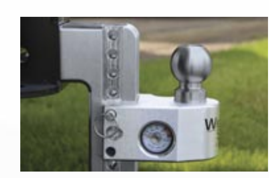
Weigh Safe Trailer Hitch Receiver

Safely and effectively measures your tongue weight while towing