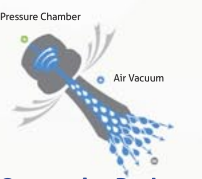
Oxygenics Body Spa RV Shower Head

The sharpest paint job on the road with five stock color options.