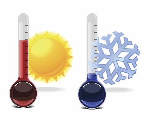
Dual 15k-BTU Air Conditioners with Heat Pumps

Take the chill out of the air without using LP.