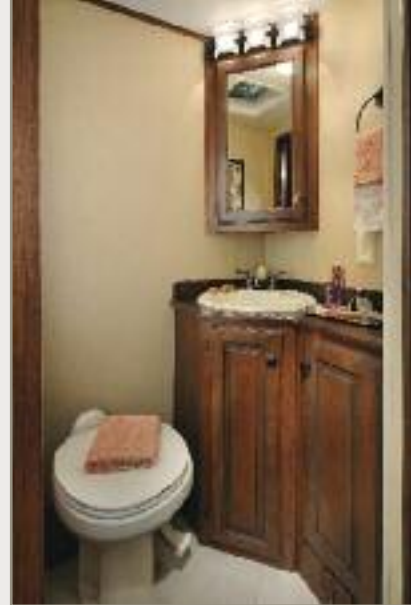
Model 390 RB half bath

Roller style sun and blackout shades throughout the coach enhance privacy.