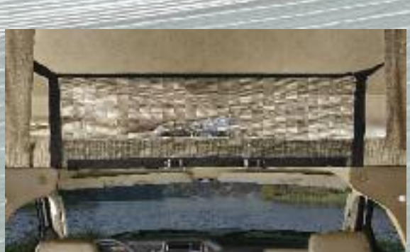
The overhead bunk is rated for 440 lbs.