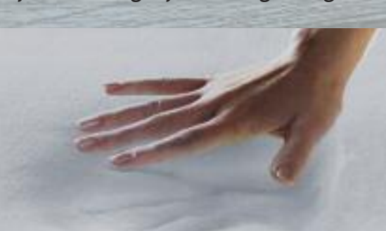
MEMORY FOAM Memory foam mattress will ensure a good nights sleep.