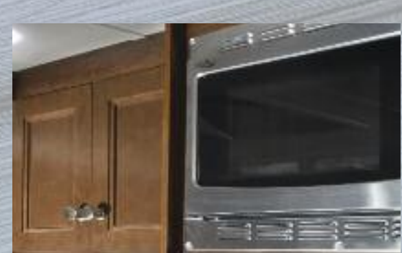
STAINLESS STEEL APPLIANCES For residential high-end appeal.