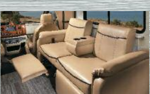
THEATER STYLE SEATING Comfortable sofa with footrests, folding armrests and drink tray converts to a convenient sleeping area.