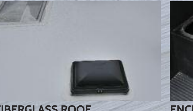
FIBERGLASS ROOF Durable, easy to clean (R-18) crowned fiberglass sheds water and doesn't cause black streaks like a rubber roof.