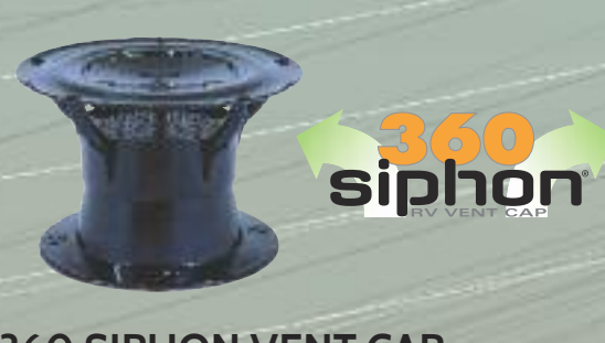
360 SIPHON VENT CAP This holding tank vent cap eliminates odors and gases from the holding tanks and exhausts them out the roof, without the use of costly chemicals.