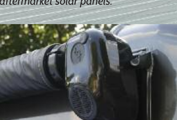
OUTSIDE SPEAKERS For directional sound delivery to the campsite.