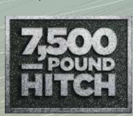
7,500 LB. TOW CAPACITY Ford E450 chassis only