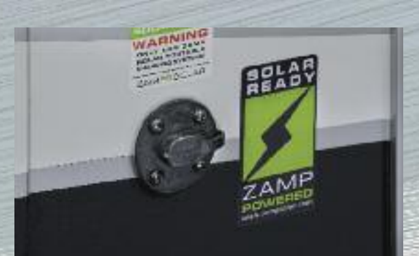
SOLAR PREP Easily charges the 12V system with aftermarket solar panels.