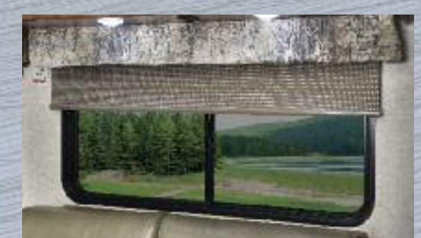
LARGE WINDOWS WITH BLACK-OUT ROLLER SHADES Large panoramic windows for plenty of fresh air and natural light.