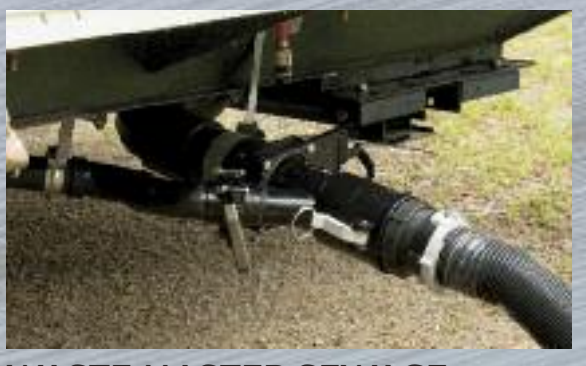
WASTE MASTER SEWAGE MANAGEMENT SYSTEM Rugged for quick, easy and sanitary disposal of waste. (N/A LE, MBS and Transit)