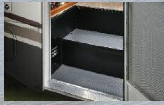
INTEGRATED STEP Forester's entry step is integrated into the sidewall. No more slippery,