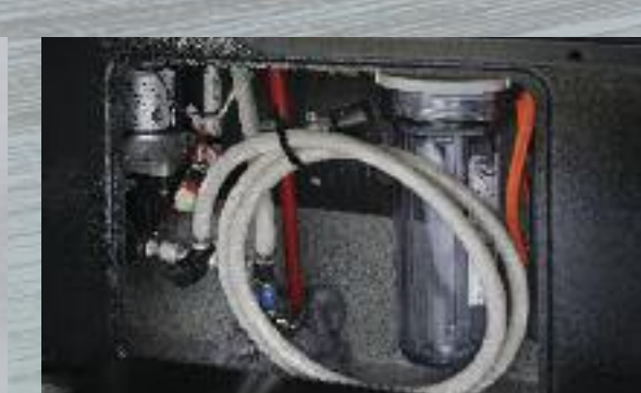
WINTERIZING TUBE Easy access for quick maintenance includes bypass valve.