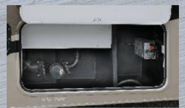
HEATED AND ENCLOSED HOLDING TANKS The utility station protects tanks and valves using warm air from the furnace. or damaged power steps. (N/A 2250 SLE, and Transit Series)