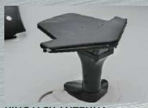
KING JACK ANTENNA This HD digitally amplified antenna enhances reception.