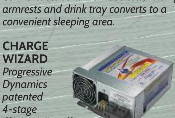
Charge Wizard® converter system can increase battery life by 2 to 3 times or more. It constantly monitors voltage and usage then selects one of four operating modes to properly charge and maintain the battery. Boost, Normal, Storage and Equalization.