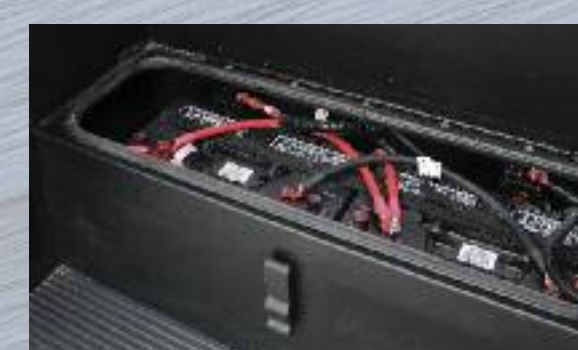
ENCLOSED BATTERIES Two batteries in a single housing for easy access. (One battery LE and Transit)