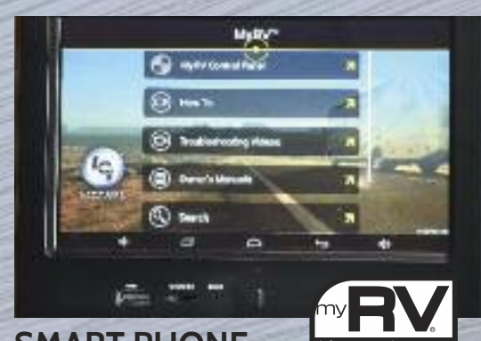
SMART PHONE REMOTE MONITOR SYSTEM Control and monitor your RV from an LED touch screen or a smart phone.