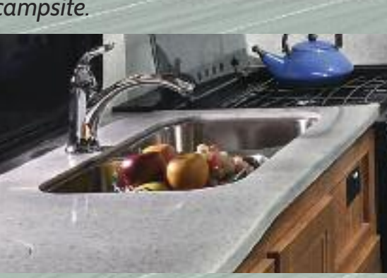
SOLID SURFACE GALLEY Upgrade features include a residential