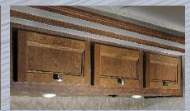
RESIDENTIAL STYLE CABINETRY Forester is appointed with ball bearing drawer glides and rich hardwood cabinetry. (Shown in Rustic Cherry)