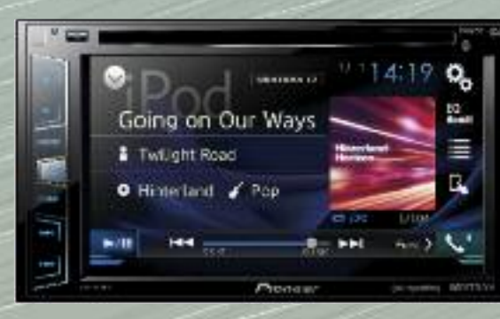
Pioneer IN-DASH STEREO SYSTEM Pairs up with your smart phone to access GPS and other applications. (N/A Transit or LE Series)