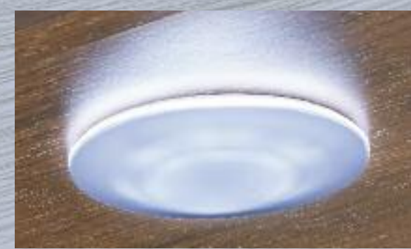
LED LIGHTING LED lights generate almost no heat compared to incandescent lights and use substantially less power.