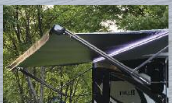
POWER AWNING WITH LED

Extend and retract your awning with the push of a button. Both arms are adjustable to get just the right angle.