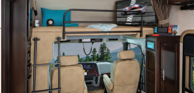
Extended Front Cap with Cab-Over Bunk