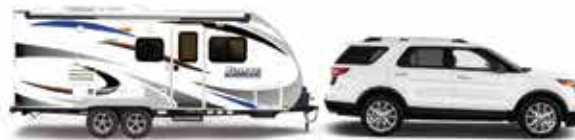
Models: 1575, 1685, 1985, 1995