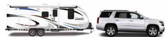
Models: 1575, 1685, 1985, 1995, 2185, 2285, 2295