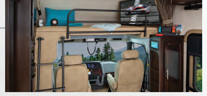
Extended Front Cap with Cab-Over Bunk

2745 Northland Dr. ■ Elkhart IN 46514 888-295-7859 ■ www.dynamaxcorp.com