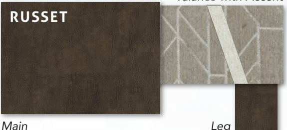
Valance with Accent