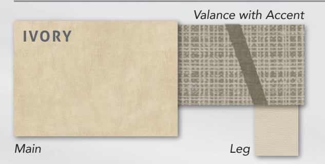
Valance with Accent FOG Main Leg