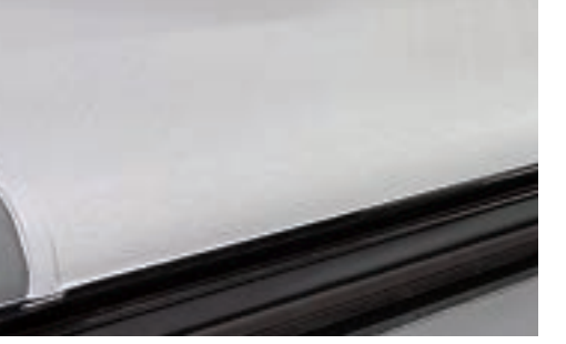
Fiberglass Roof This crowned, one-piece, fiberglass roof is more durable and easier to maintain than TPO or rubber.