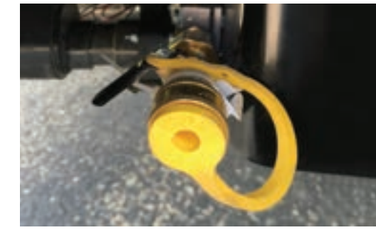
LP Quick Connect Each Isata 5 comes with an LP quick connect for use with a portable grill.