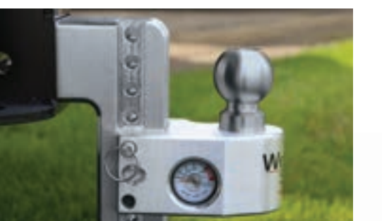
Weigh Safe Trailer Hitch Receiver Safely and effectively measures your tongue weight while towing.