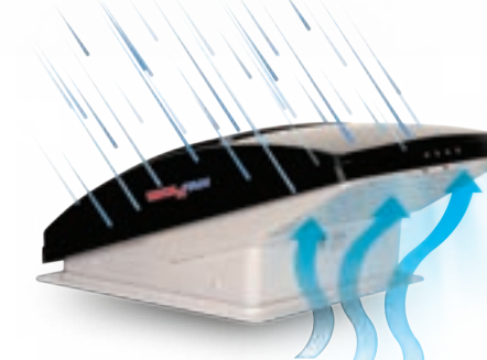
MaxxAir Fans Each standard fan features a built-in rain cover.