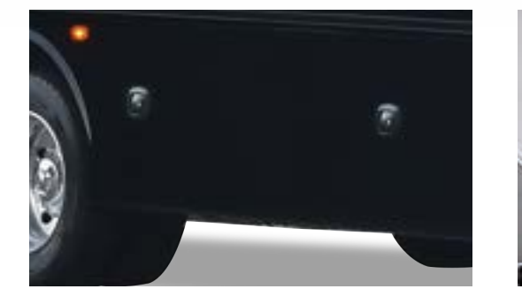
Slam-Latch Baggage Doors Our heavy-duty aluminum doors feature metal slam latches.