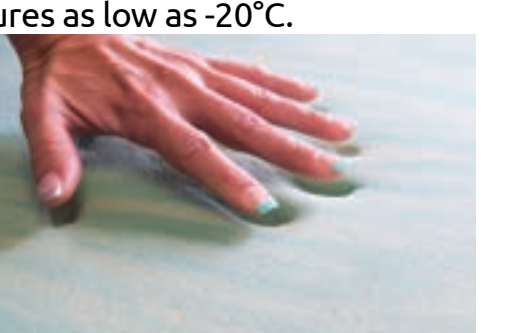
Gel-Infused Memory Foam Mattress Provides enhanced comfort with better heat dispersion.

With a built-in heater, these batteries can charge at temperatures as low as -20°C.