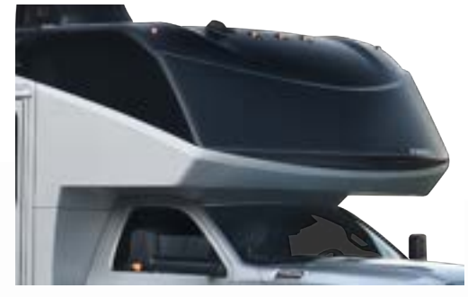
Cut & Buffed Premium Full-Body Paint with Front Diamond Shield The sharpest paint job on the road with five color options.