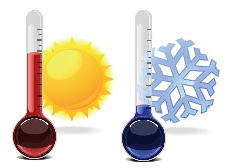
Dual 15k-BTU Air Conditioners with Heat Pumps Take the chill out of the air without using LP.