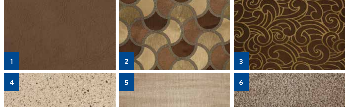
1 | Sofa 2 | Accent 3 | Bedspread 4 | Countertop 5 | Flooring 6 | Carpet