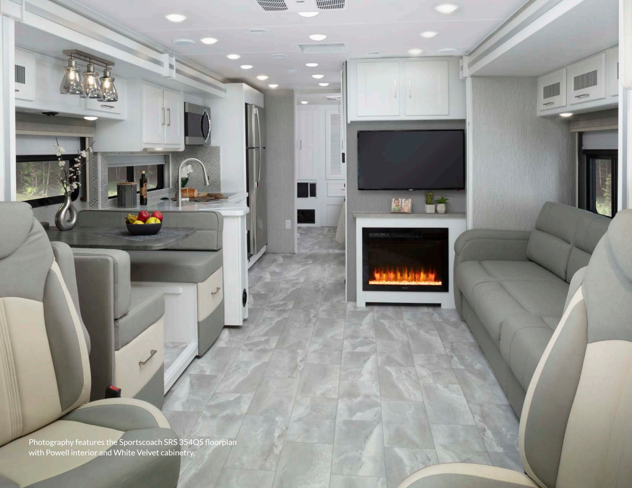
Photography features the Sportscoach SRS 354QS floorplan with Powell interior and White Velvet cabinetry.