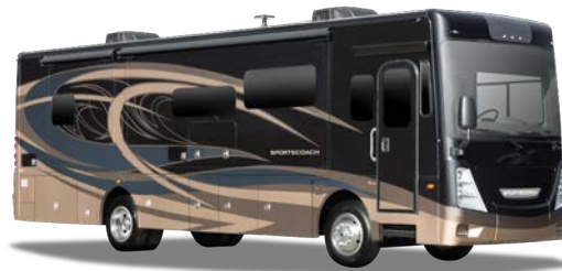
Full Body Paint - Meteor