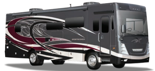
Full Body Paint - Magenta