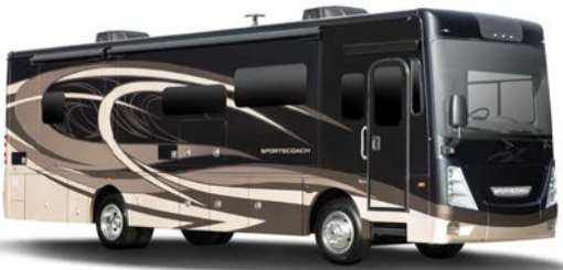
Full Body Paint - Sandstone