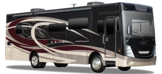
Full Body Paint - Rosewood