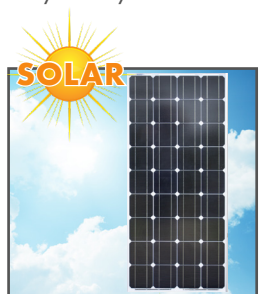
SOLAR POWER 100 watt solar panel, providing renewable power.