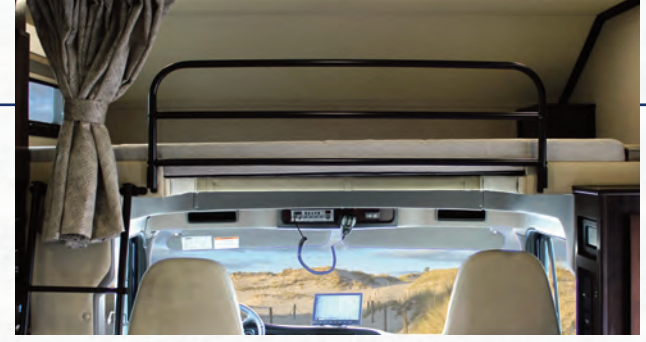
Standard Cab-Over Bunk