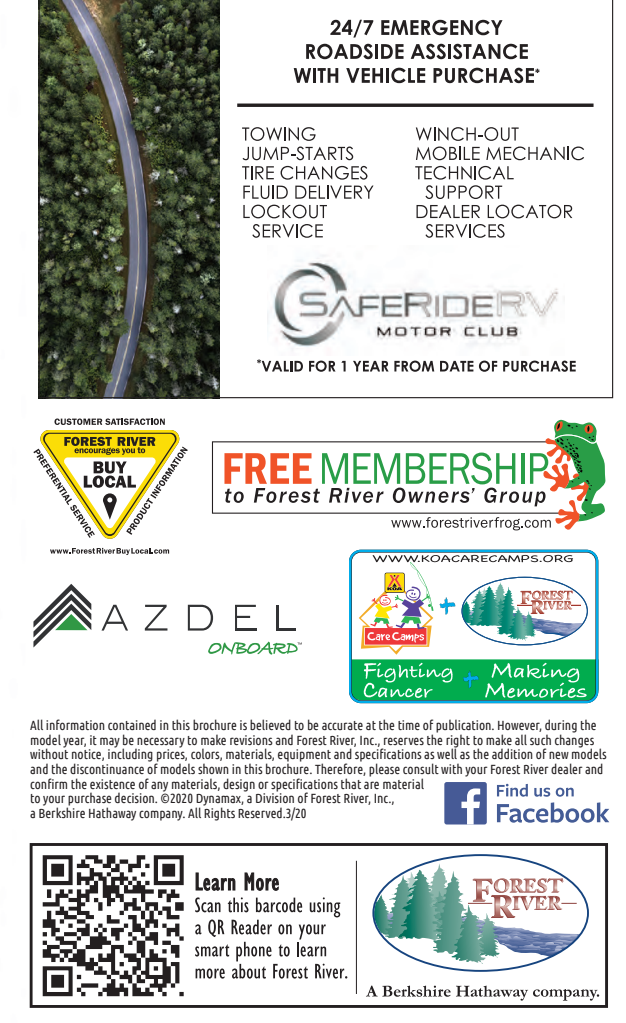
Your Authorized FORCE HD Series Dealer