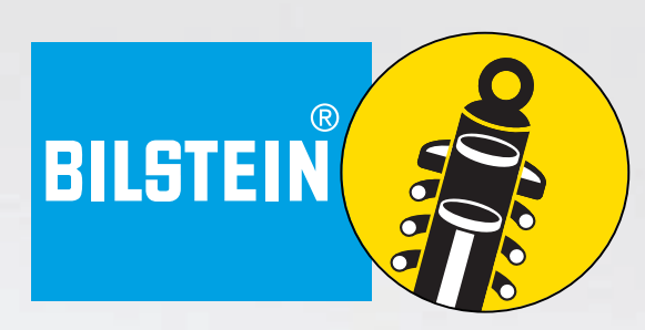
Bilstein Gas-Charged Rear Shock Absorbers

Never run out of hot water again with state-of-the-art Truma® AquaGo™ on-demand water heater.