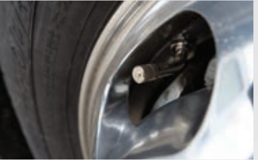
Tire Pressure Monitoring System with Metal Valve Extensions

Upgraded shocks allow for better driving comfort, performance, and safety.