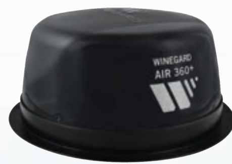
Winegard AIR 360+ with Gateway Router Omnidirectional VHF/UHF OTA, FM, SIM Card Port