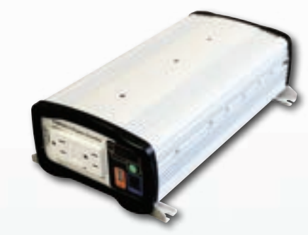
2000W Pure Sine Wave Inverter

Power your AC devices without shore power or running the generator.