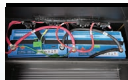
Dual Low-Temp Lithium Aux iliary Batteries (200aH Total) With a built-in heater, these batter- WiFi Extender, 4G LTE. ies can charge at temperatures as low as -20°C.