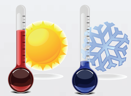
15k BTU Air Conditioner with Heat Pump

Power your AC devices without shore power or running the generator.