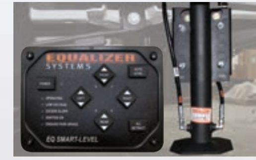
Automatic, 4-Point Hydraulic Leveling Jacks with Bluetooth Smart Phone App Control

Dual-Pitch, armless awning retracts automatically in high winds.