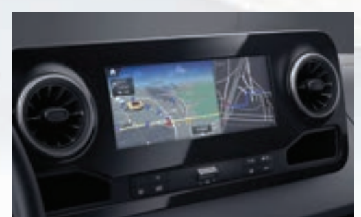
MBUX- Mercedes-Benz User Experience

The patented Oxygenics Engine supercharges any water pressure, turning weak flows into satisfying showers.