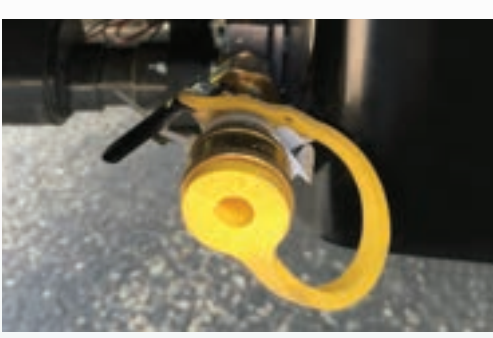
LP Quick Connect Each Isata 3 comes with an LP quick connect for use with a portable grill.