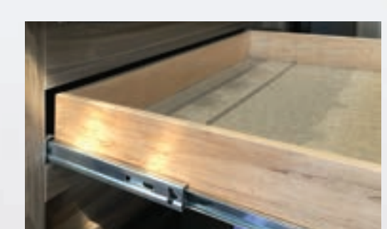
Soft-Close Residential Drawer Guides

This gel-infused memory foam mattress provides enhanced comfort with better heat dispersion.