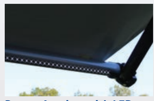
Power Awning with LED Light Strip

The "Soft-Close" feature keeps drawers closed during travel without plastic latches.