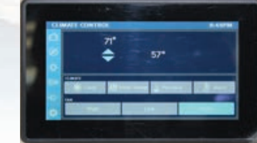
Firefly Multiplex Wiring

10.25" Touch Screen with Smart Wheel Controls, Built-in Navigation, Apple CarPlay/ Android Auto, and "Hey Mercedes" Voice Control.