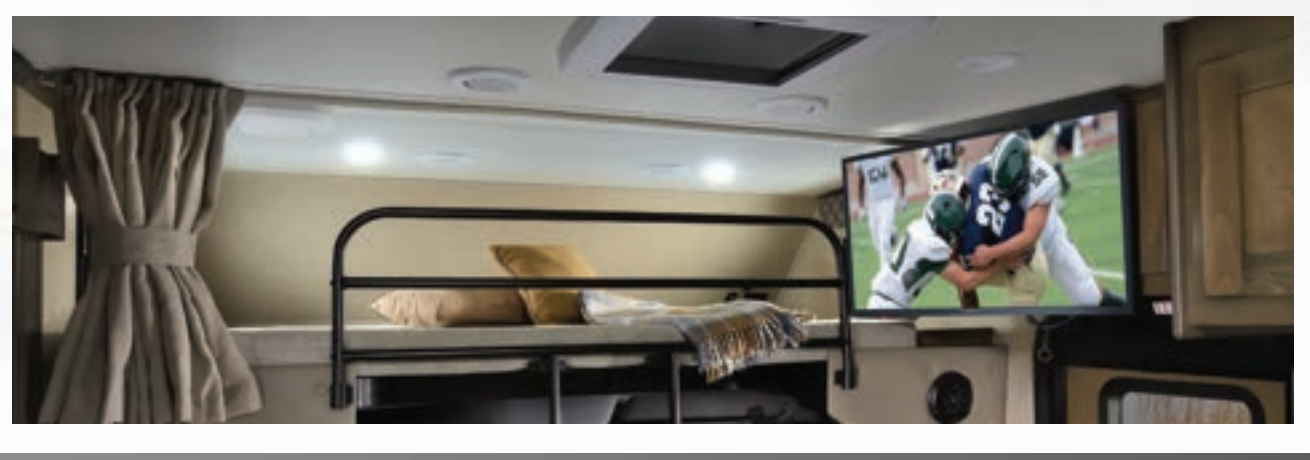
Cab-Over Bunk Option

Touchscreen Command Center, Bluetooth App Control, Back-lit Switch Panels, and TruTank Level Monitoring (measures tank levels in 5% increments).