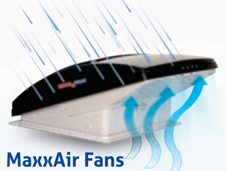
Each standard fan features a built-in rain cover.