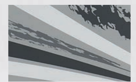
Cut & Buffed Premium Full-Body Paint with Diamond Shield

Drive with confidence knowing your tires are safely inflated.