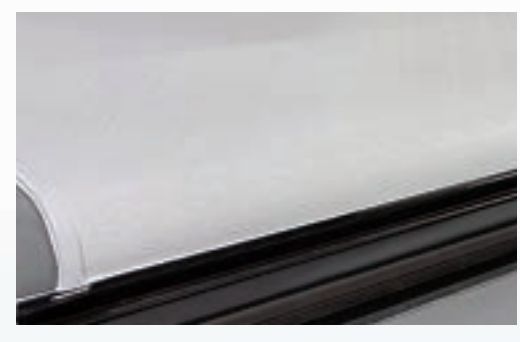
Fiberglass Roof This crowned, one-piece, fiberglass roof is more durable and easier to maintain than TPO or rubber.