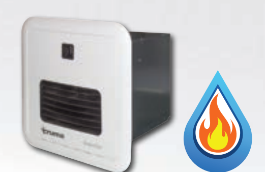
On-Demand Water Heater

Progressive Dynamics converter with the patented 4-stage Charge Wizard® system has been shown to increase the battery life by 2 to 3 times or more.