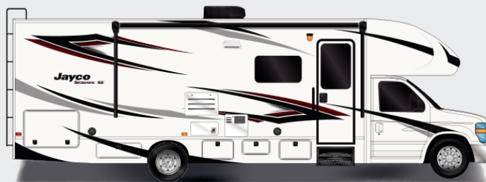
Standard Graphics Package